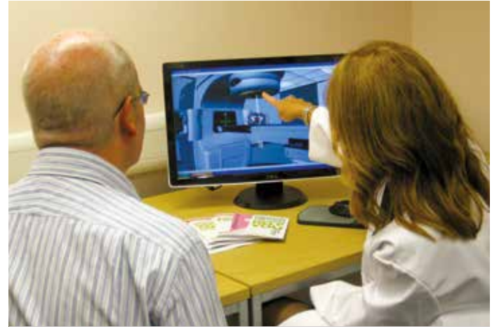
PEARL™ - A Linac on your desktop, designed to be user intuitive and patient focused.